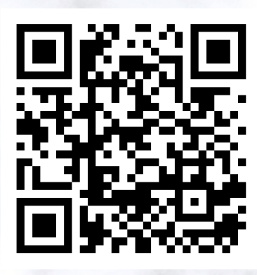
Scan QR Code to register